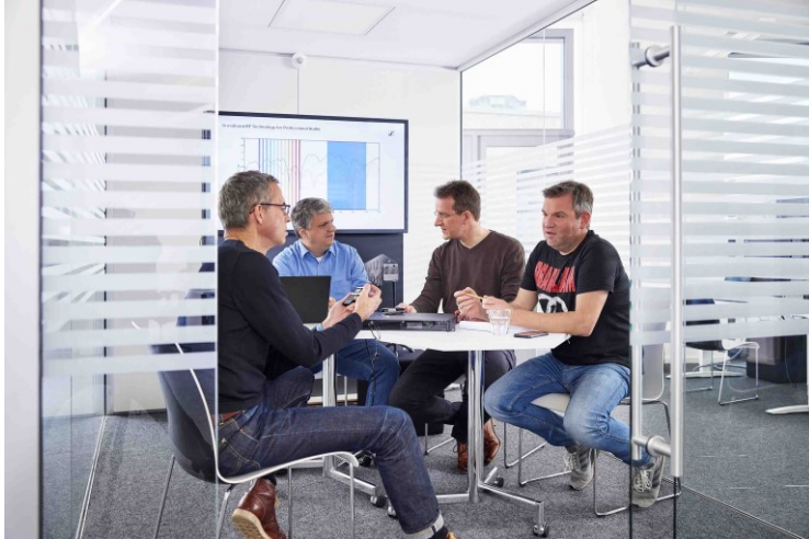
Team discussion on the latest WMAS engineering samples

Allow me to ask why you are using a manufacturer-specific transmission technique.